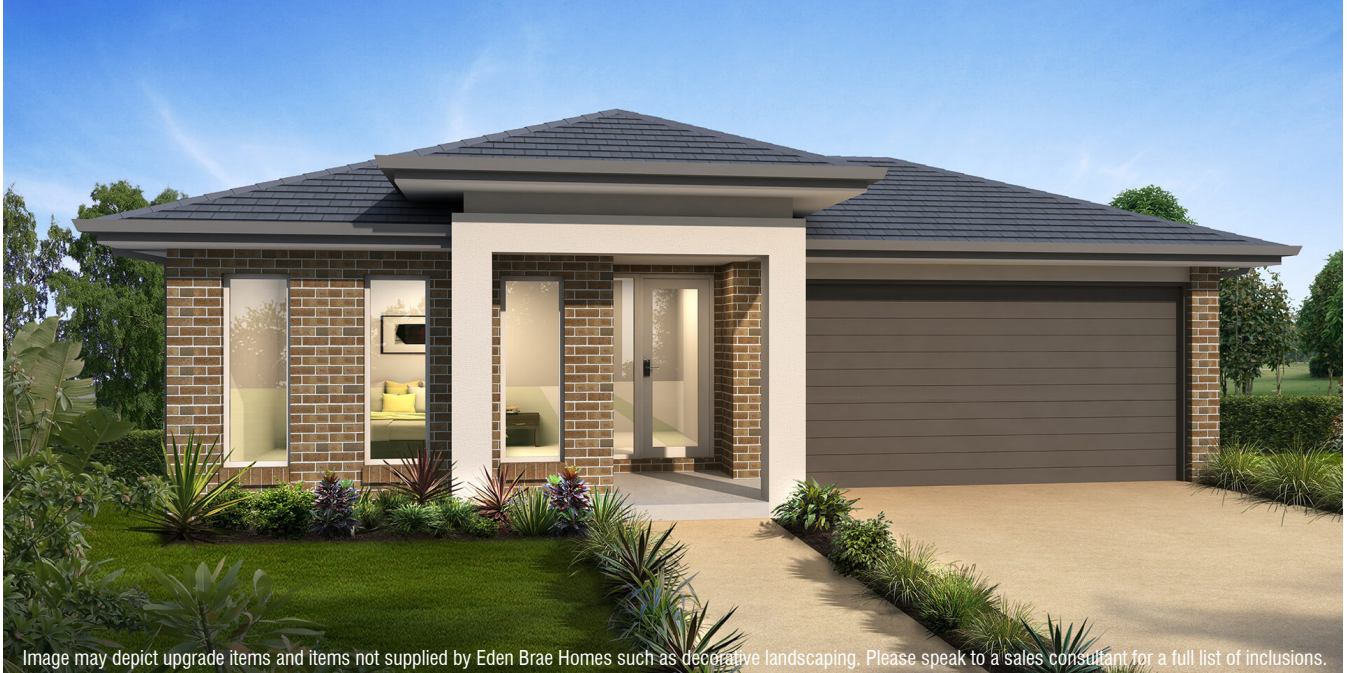
Image may depict upgrade items and items not supplied by Eden Brae Homes such as decorative landscaping. Please speak to a sales consultant for a full list of inclusions.