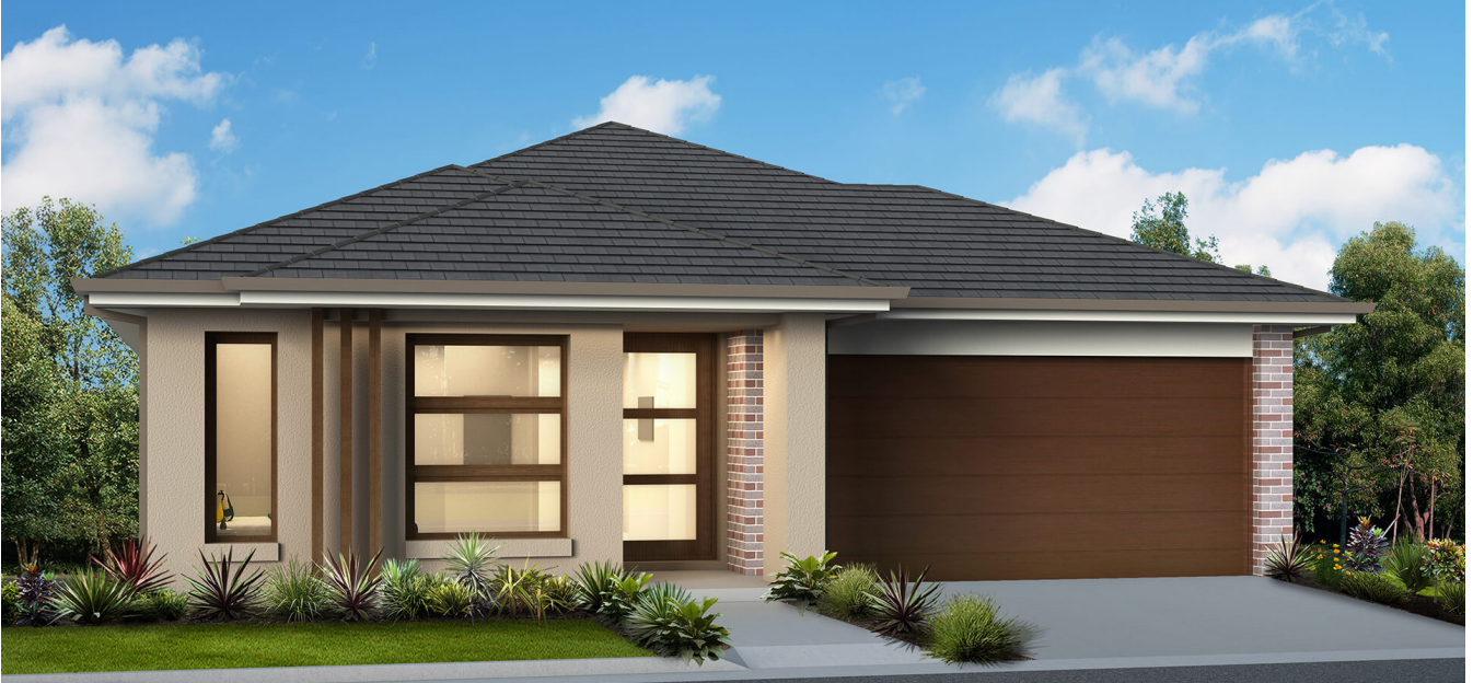
Image may depict upgrade items and items not supplied by Eden Brae Homes such as decorative landscaping. Please speak to a sales consultant for a full list of inclusions.